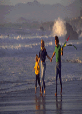
Oh, to be by the sea

Have you ever thought about presenting your own radio show? Fancy playing your music on the local airwaves? Well Spey-sound are looking for people to present radio programmes, in the evening at present, but hours will change when they have their own license in June Full training given. Based in Aviemore